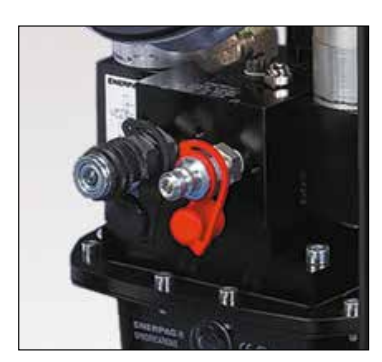
800 bar Lock-ring Couplers

Model-Nr: CMF-250 male coupler CFF-250 female coupler