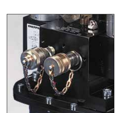
700 bar Spin-on Couplers

Model-Nr: TH-630 male coupler TR-630 female coupler