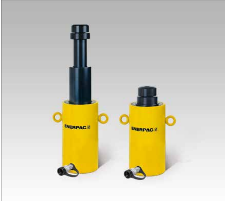
▼ RT-2111 Telescopic Cylinder (shown with plunger extended and retracted)

ENERPAC POWERFUL SOLUTIONS. GLOBAL FORCE.