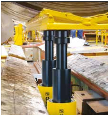
◀ The longer stroke length of telescopic cylinders will save you time and simplify projects by moving a load a greater distance and eliminating the use of temporary cribbing.

All RT-Series cylinders include integral tilt saddles with maximum tilt angles up to 5 degree.