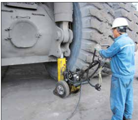
◀ Enerpac POW'R-RISER® used in mining operations to lift heavy equipment.