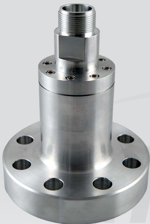
Model 7501-9000 Subsea Wellhead Pressure Transmitter

The 7501-9000 Series from GP:50 is a high-accuracy subsea rated pressure transmitter offering more than 15 years of field-proven pedigree. This Series features an API flanged process connection with Inconel inlay and all stainless steel housing with full seawater compatibility to 30K ft (9,144 M). Pressure ranges available from 0-500 through 0-30,000 psi with 4-20mA output or optional digital protocols.