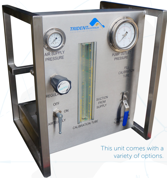
This unit comes with a variety of options.

Trident Australia Chemical Injection Unit incorporating a choice of Solar Injection/Morgan pumps available in ratios from for pressures to 11,500 psi.