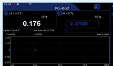
Pressure gauge / transmitter / switch calibration