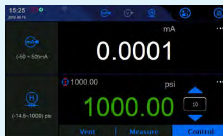
High Pressure Automated Calibration