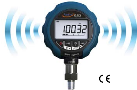
680 with data logging and wireless (optional)